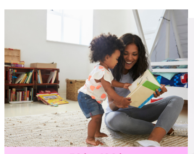
50$ = 100$ Child's annual subscription to enriching books

Encourage a strong social fabric for children.