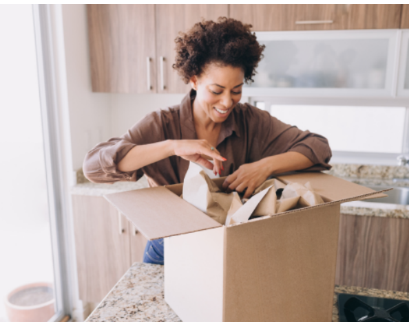
75$ = 150$ Help a mother and her children move home