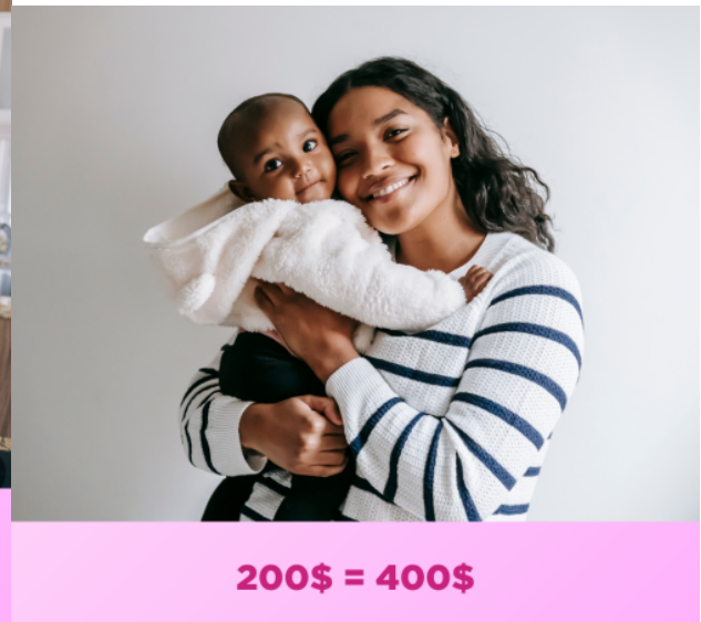
25 lunch boxes for a family