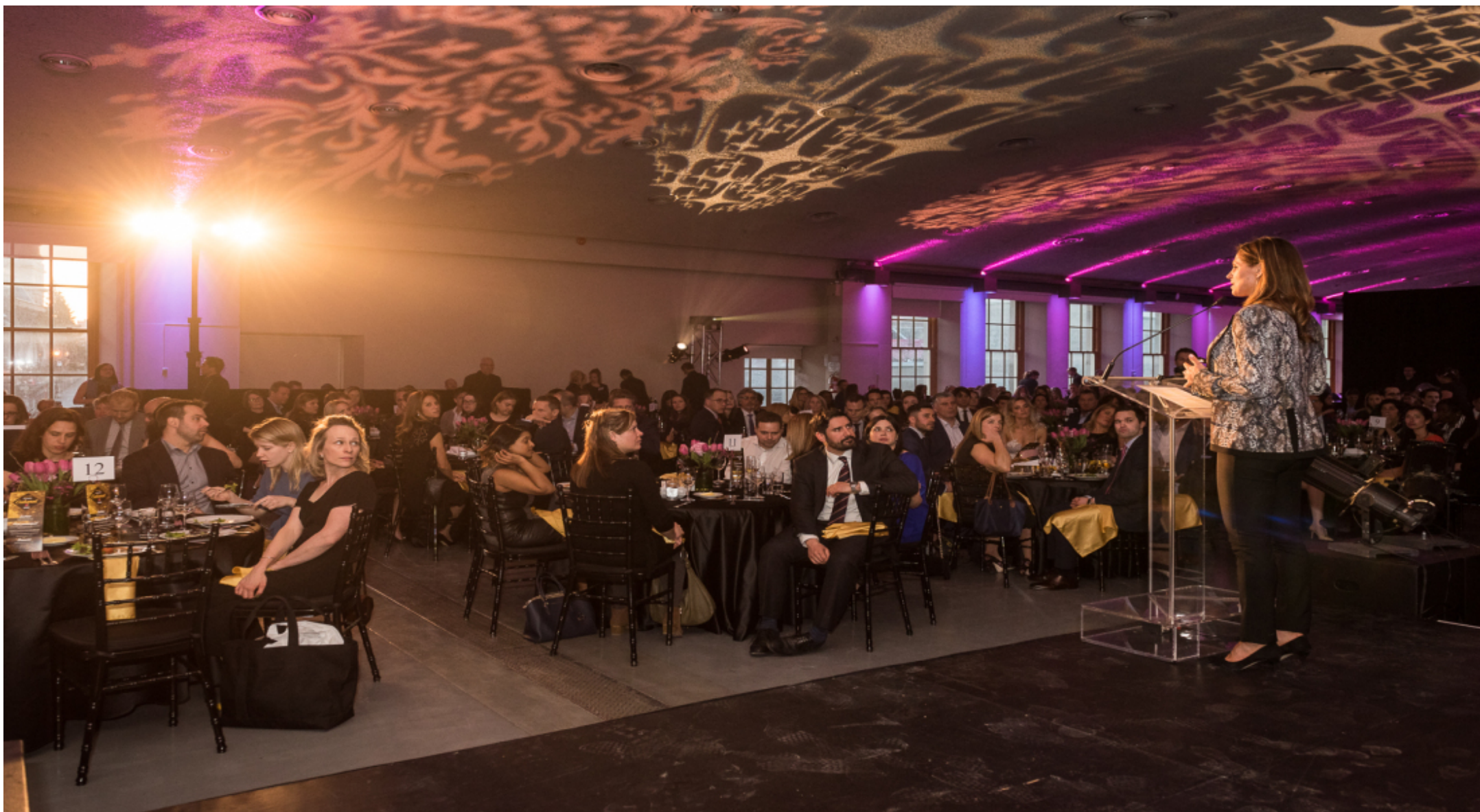
Recap of the 5th annual “Soirée Cabaret” of Fondation Mères